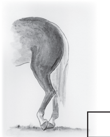
5. Resting on one leg