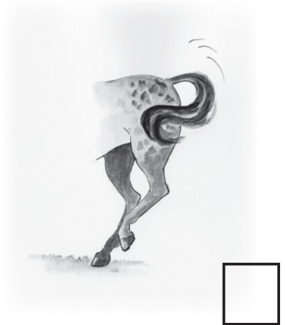
4. Tail flicking