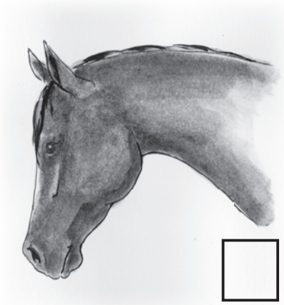
1. Ears forward

What are these horses saying? Match up the pictures of horse behaviour to the written description of how the horse is feeling. Fill in the box with the corresponding letter.