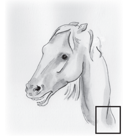
3. Ears flat back