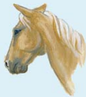
Ears relaxed - Listening to sound from behind