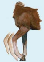
Pawing - Impatient