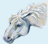
Ears flat back - Territorial protection. Be careful!