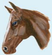
Ears forward - Curious / Alert