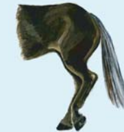
Resting on one leg - Relaxed