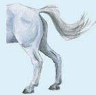
Tail Flicking - Annoyed or Flies